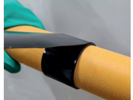
3. Remove sanding residue and wrap anti-sliding tape with 100% overlap in required layers