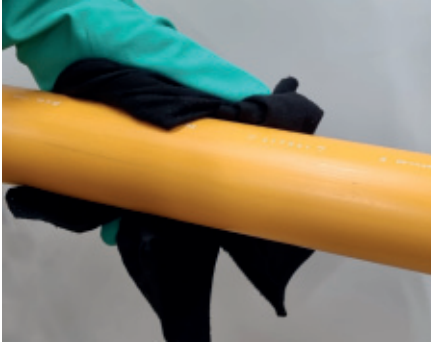
1. Clean pipe surface, dry, degrease

The system comes with gloves and adhesive tape. Safety glasses should be worn during processing. Skin contact has to be avoided.