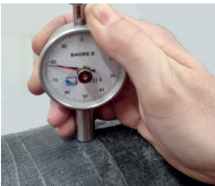
7. Check curing after approx. 60 minutes (approx. Shore D 70±)