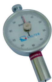
Shore D measuring tool