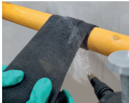
5. Wrap the Pipecoat Plus tape with 100% overlap in required layers. Spray water on the tape continuously during the wrapping process. Time of processing 2-3 min., depending on temperature