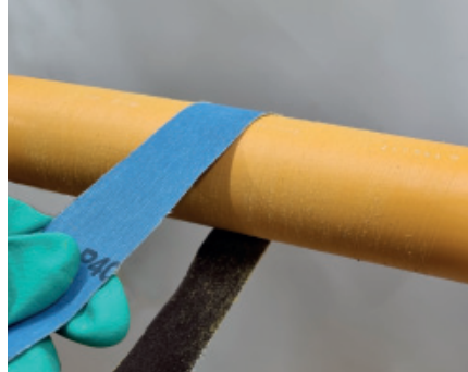
2. Roughen with emery (corn 40-6)