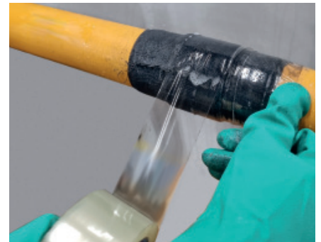
6. Overwrap with clear foil or adhesive tape tightly