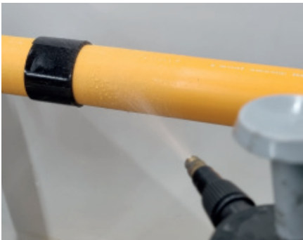
4. Moisten surface incl. anti-sliding tape